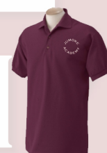
POLO SHIRTS (Mandatory for Physical Education)