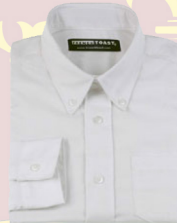
LONG SLEEVE OXFORD