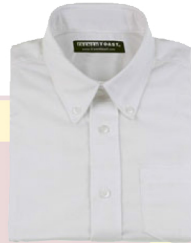
SHORT SLEEVE OXFORD