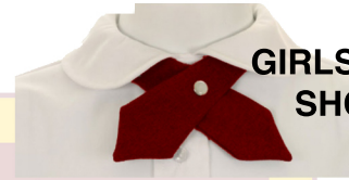
GIRLS PETER PAN SHORT SLEEVE