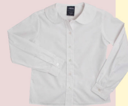
GIRLS PETER PAN LONG SLEEVE