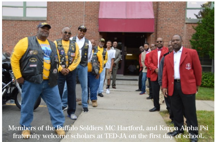
Members of the Buffalo Soldiers MC Hartford, and Kappa Alpha Psi fraternity welcome scholars at TED-JA on the first day of school.