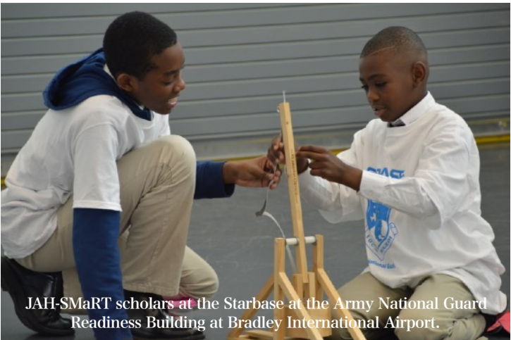
JAH-SMaRT scholars at the Starbase at the Army National Guard Readiness Building at Bradley International Airport.