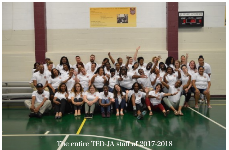
The entire TED-JA staff of 2017-2018