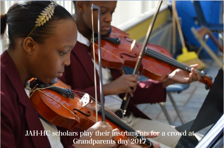
JAH-HC scholars play their instruments for a crowd at Grandparents day 2017