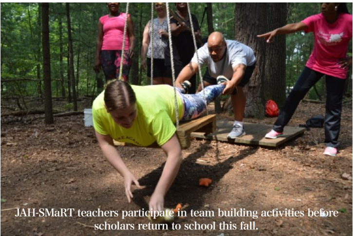
JAH-SMaRT teachers participate in team building activities before scholars return to school this fall.