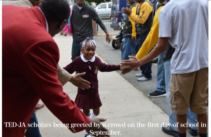
TED-JA scholars being greeted by a crowd on the first day of school in September.