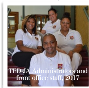
TED-JA Administrators and front office staff, 2017